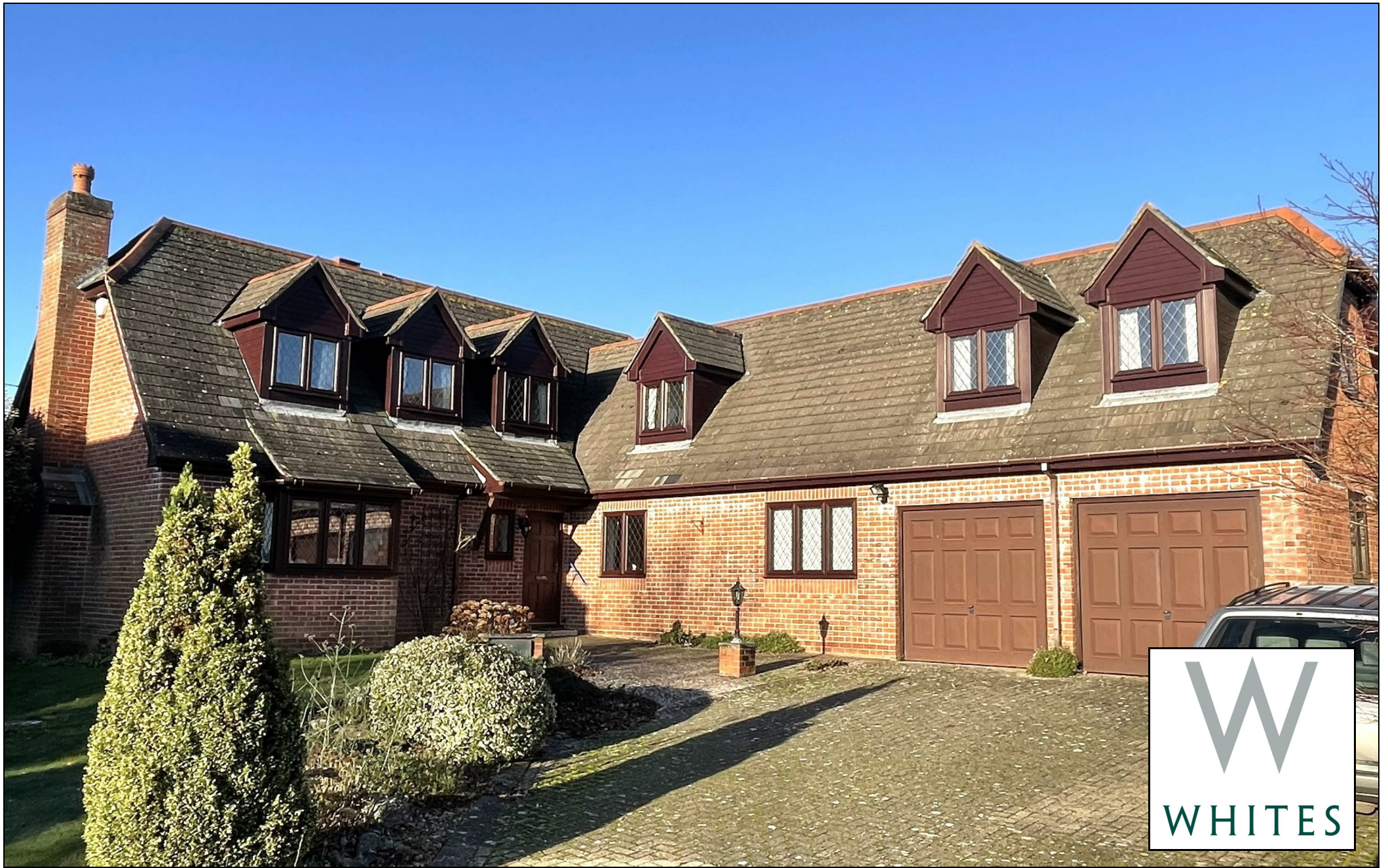
4 The Bramleys, Whiteparish, Salisbury, Wiltshire, SP5 2TA